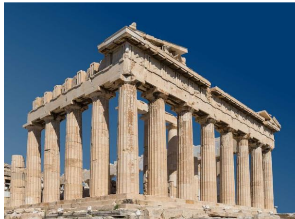
The Acropolis, Athens, Greece

Alan Garrow, Vicar of St Peter's Church, Harrogate