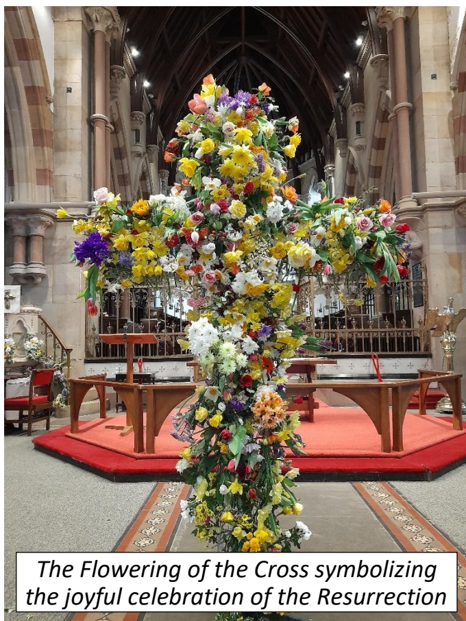
The Flowering of the Cross symbolizing the joyful celebration of the Resurrection