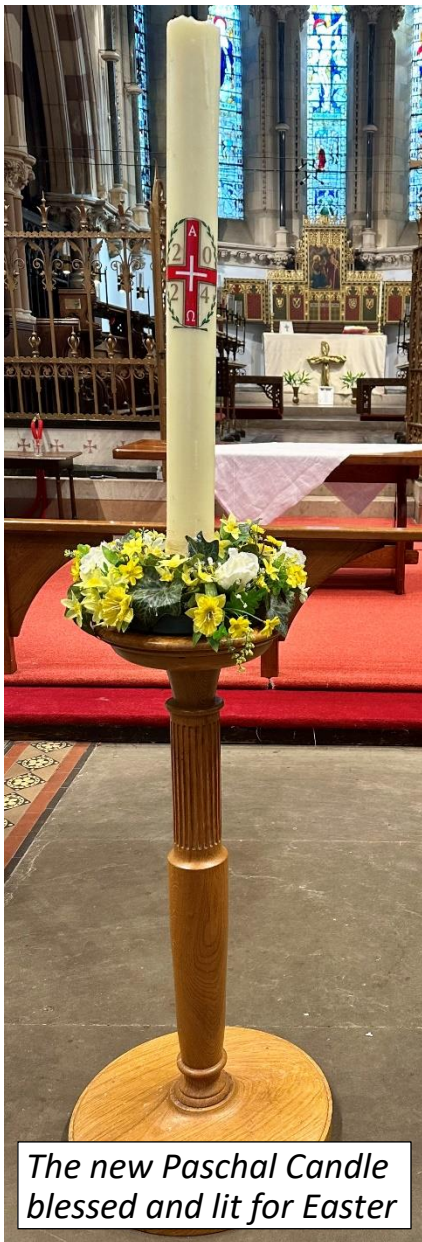
The new Paschal Candle blessed and lit for Easter