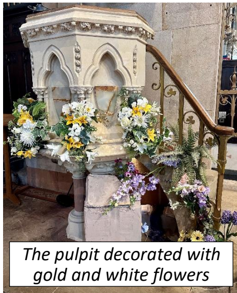
The pulpit decorated with gold and white flowers