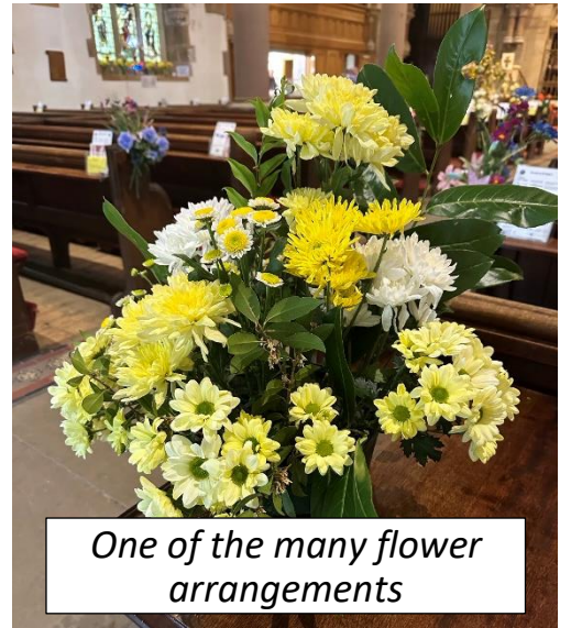
One of the many flower arrangements