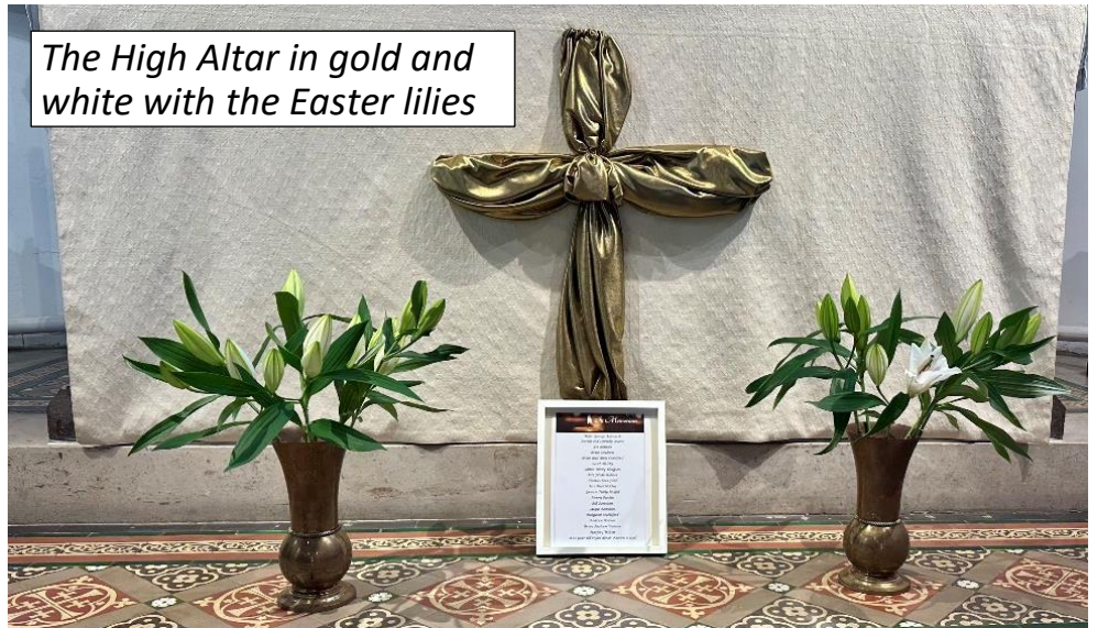
The High Altar in gold and white with the Easter lilies