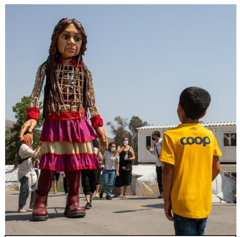
Little Amal meets a refugee boy at Breil sur Roya in the Alpes-Maritime region near the Italian border.

Little Amal, a 3.5 metre (nearly 12') tall puppet, has walked across Europe to shine a light on the stories of millions of young refugees. She has travelled through eight countries, and been welcomed by hundreds of cultural events in cities, towns and villages all along her route. Little Amal started her 5,000 mile journey in Gaziantep, Turkey, near the Syrian border on 27<sup>th</sup> July 2021 and this week on 3<sup>rd</sup> November she will reach her final destination - Manchester.