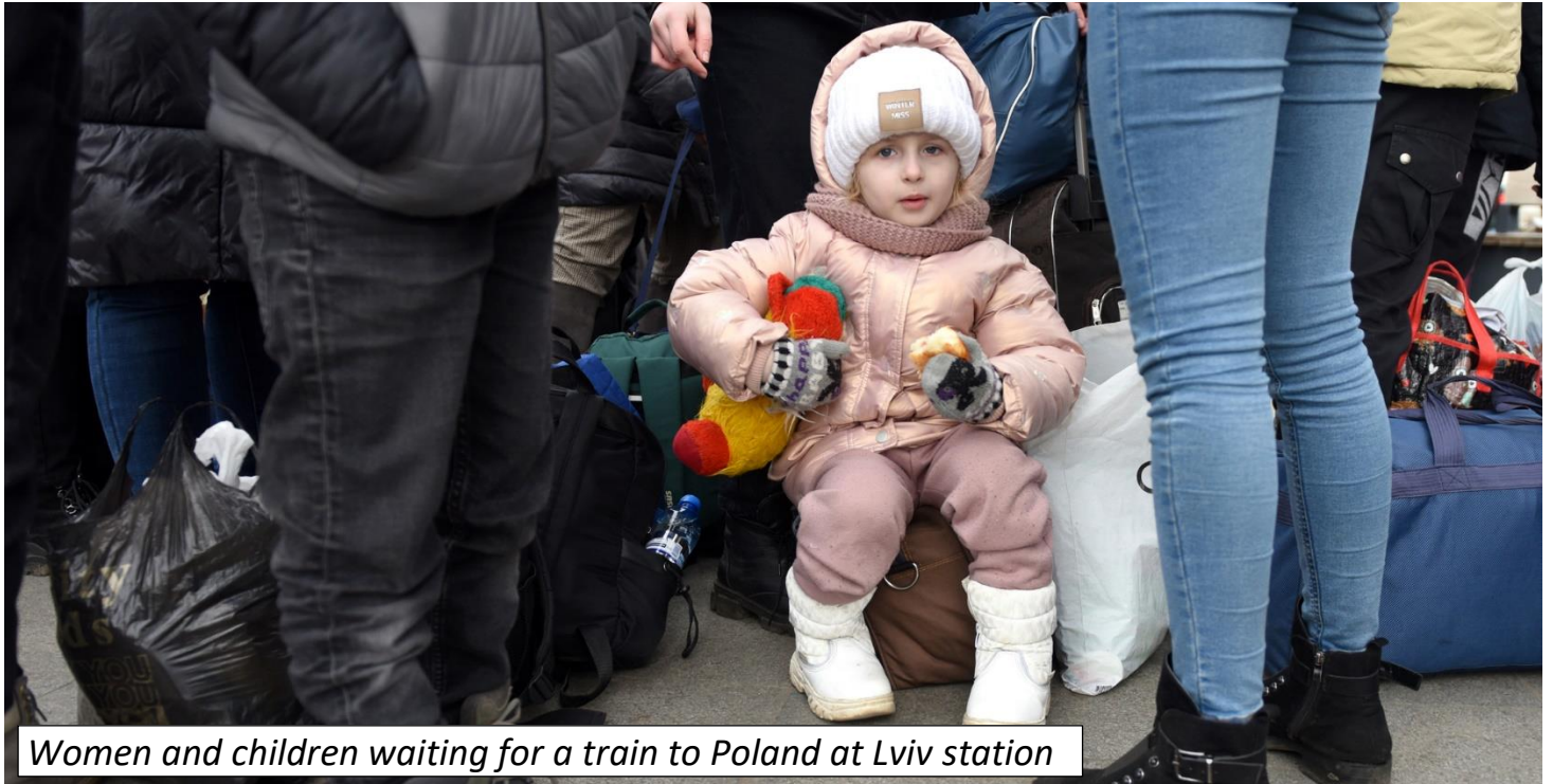
Women and children waiting for a train to Poland at Lviv station

Stories of separation fill the news. Families are being torn apart as refugees flee Ukraine in the hope of finding safety. War, injustice, oppression always have this effect. So, on this Mothering Sunday, we pray especially for those who, for whatever reason, are far separated from their families and uncertain when, if ever, they will see them again.