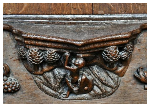
One of the 15 th century misericords at Ripon Cathedral depicts the story of Jonah and the Whale.