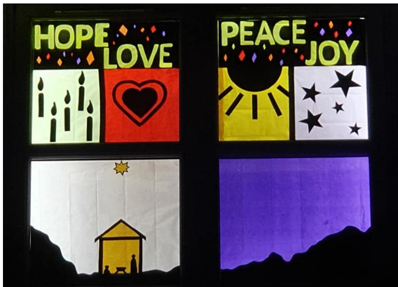
These windows are part of Harrogate Hub's The Light Shines Trail – seen at a house in Jennyfields ...

Here we are again. As the circle of the year turns, we find ourselves at a point that seems very little distant from where we were last Christmas. We are all too conscious of the fragile state of our Health Service. We see businesses continue to struggle. The Government has diminished authority. The COP26 talks have not left us with much cause for optimism in relation to the climate. And, to top it all, the Omicron variant leaves us facing a rising wave of uncertainty as we head towards the New Year.