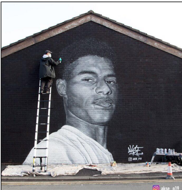
This mural of Marcus Rashford in Manchester had been defaced but has now been repaired and covered with messages of support opposing racism.

The Archbishop of Canterbury, Justin Welby, who is on sabbatical and not attending Synod, also tweeted: This @England team are an example, a gift and a reflection of what's best about this country. Rashford, Sancho and Saka showed incredible courage in stepping up to take penalties. Those who are racially abusing them show the opposite and must be held accountable.